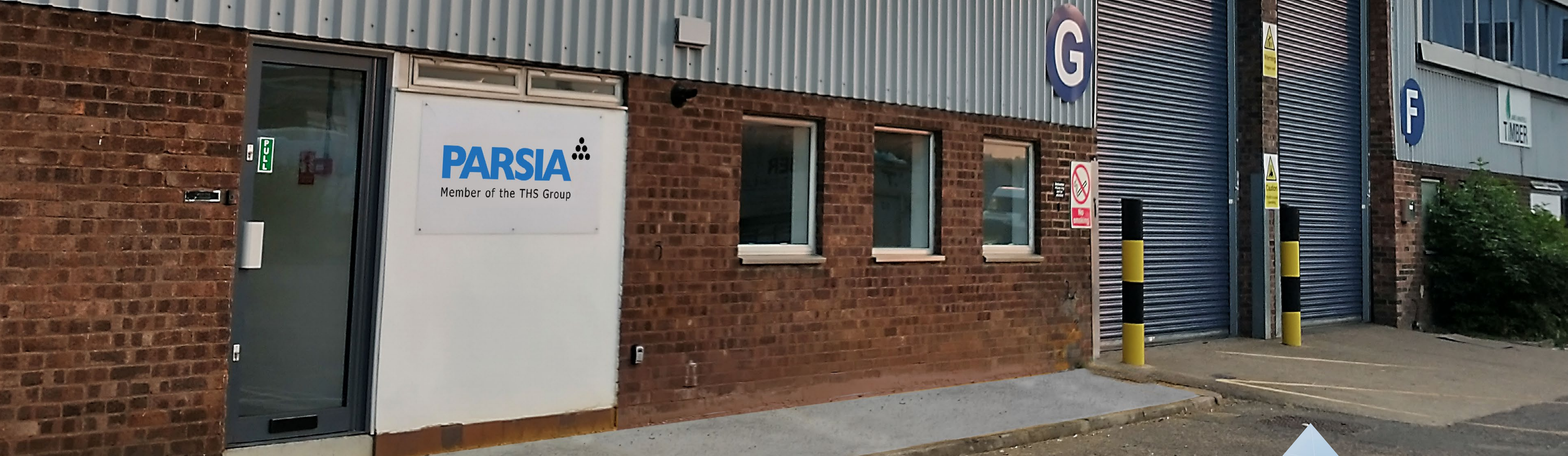
Parsia headquarters in Uxbridge