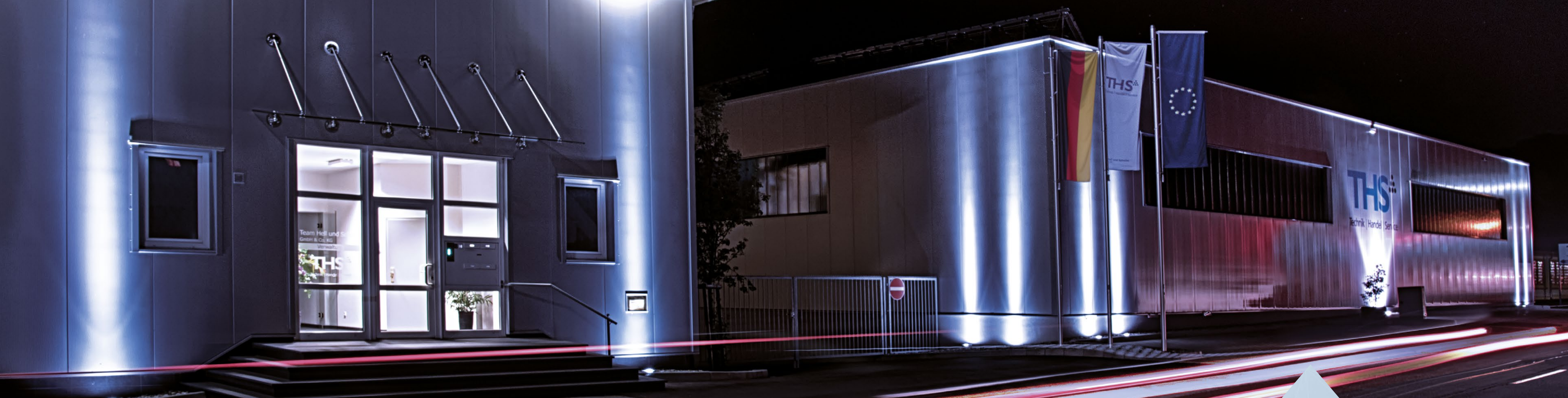
THS headquarters in Hemer-Ihmert